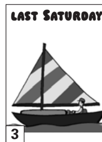
(on a boat)