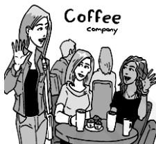
5 m _____ f _____