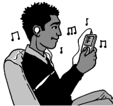
1 l _____ m _____