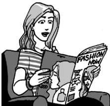
4 r _____ m _____