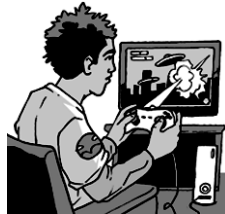
3 p _____ c _____