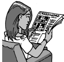
2 d _____