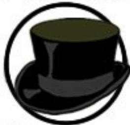
2 BLACK HAT