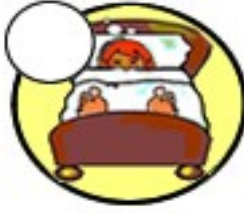
to get ill