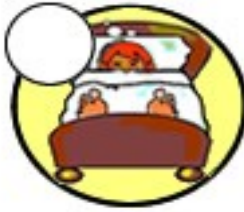
to get ill