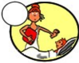
to look after

Write the number of the definition on the circle.