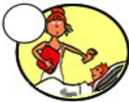
to look after

Write the number of the definition on the circle.