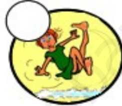
to fall over