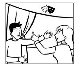
1 actor and

actor actress audience cinema comedy historical drama romance theatre tragedy